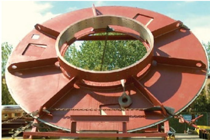
Bearing cover (with the weight of ca. 2000 kg) of electrical machine rotor