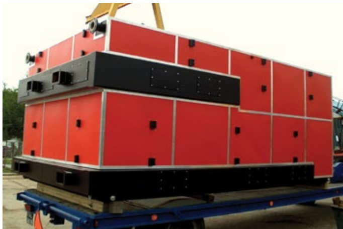
Furnaces and large-dimension furnace exchangers with the weight of 10 - 20 t (or bigger)