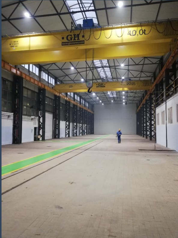
HALL H5 – 1250 sq. m