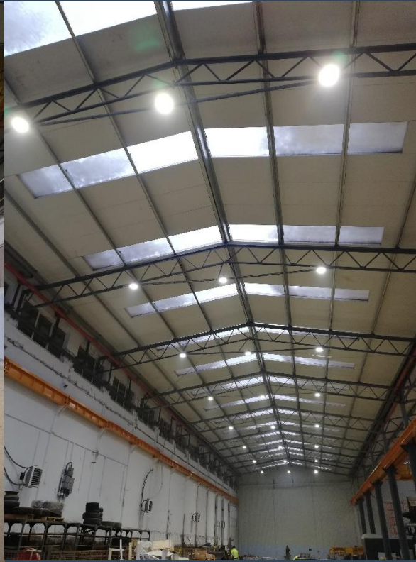
HALL H6 – 1250 sq. m